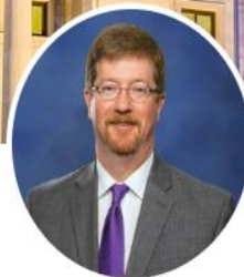
Johnny Key Secretary of the Department of Education

The Arkansas State Library System, Schools for the Deaf & the Blind, and the MLK Commission and Board also fall under the newly formed Department of Education.